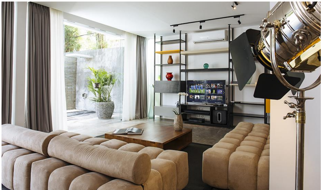
Villa Canggu pushes all the right buttons for any interior addict...

And as stunning as the villa's surrounds are, its interiors are equally as amazing. Laced with private collections of contemporary Indonesian art and framed by ultra-modern architecture, Villa Canggu could easily be at home in Malibu or downtown Venice Beach. Colourful paintings, murals and installations dot the fresh white-wash spaces, including a fascinating futuristic sculpture of a ship that's suspended from the ceiling. Bright, intelligent and stylishly modern, this villa pushes all the right buttons for any interior addict.