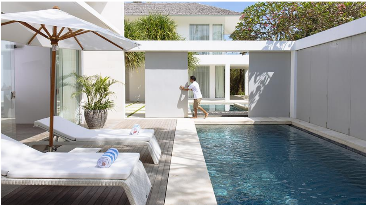
With its versatile sliding walls, Villa Canggu can transform to become an enormous 6-bedroom estate...